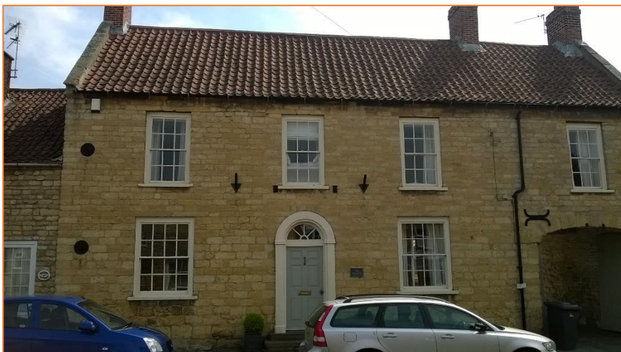
Above: Traditional materials such as timber doors and windows and clay pantiles contribute strongly to the quality of the historic environment

Enforcement action is pursued by the District Planning Authority and is undertaken by the Compliance and Enforcement Team. The Council's Conservation function works with the Compliance and Enforcement Team to tackle any breaches of planning control and will use the appraisal and this management plan as a means of justification for the expediency of any action taken.