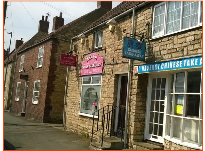
Above left: Sensitively designed shopfront and signage