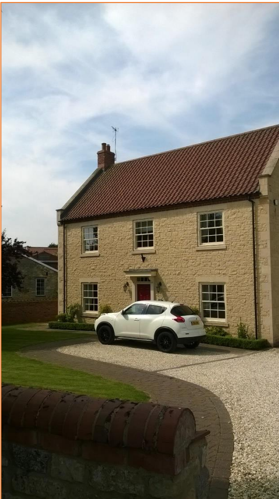
Above: Traditional materials and architectural features incorporated into a modern building

Appropriate external materials and finishes will be expected on all new development. Traditional materials typical of the conservation area will normally be expected and boundary treatments should follow the form of those existing in the area.