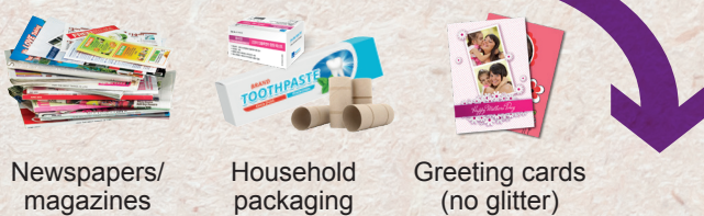
Newspapers/magazines Household packaging Greeting cards (no glitter)

Flatpack all boxes and remove as much tape as possible. Staples in magazines are acceptable.