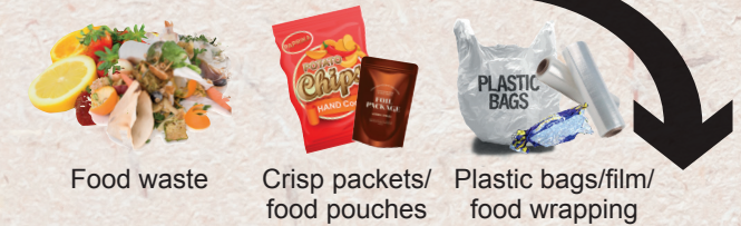
Food waste Crisp packets/food pouches Plastic bags/film/food wrapping