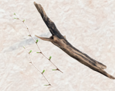
Twigs and branches