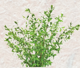
Hedge trimmings /cuttings

Take additional waste to your Household Waste Recycling Centre (HWRC)