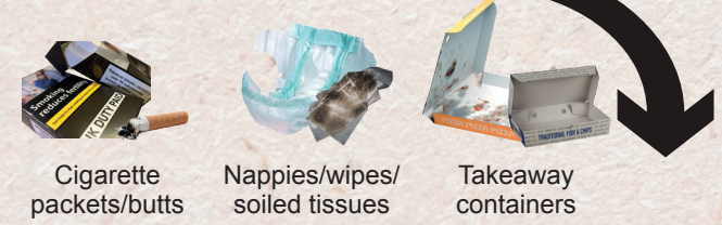
Cigarette packets/butts Nappies/wipes/soiled tissues Takeaway containers