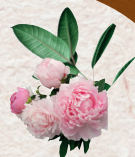
Flowers and plants