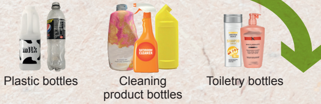
Plastic bottles Cleaning product bottles Toiletry bottles