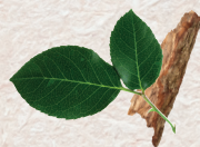
Leaves and bark