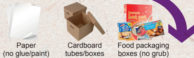
Paper (no glue/paint) Cardboard tubes/boxes Food packaging boxes (no grub)

CLEAN, DRY AND LOOSE Anything wet or damp please place in black bin