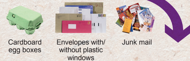
Cardboard egg boxes Envelopes with/without plastic windows Junk mail