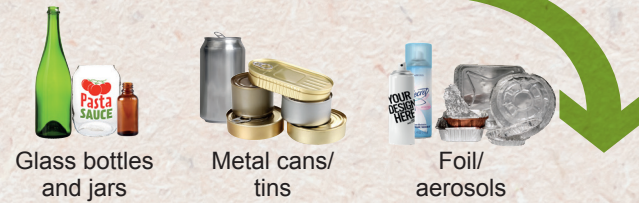
Glass bottles and jars Metal cans/tins Foil/aerosols

CLEAN, DRY AND LOOSE Squash cans and plastic bottles