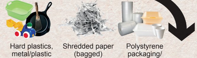
Hard plastics, metal/plastic pots and pans Shredded paper (bagged) Polystyrene packaging/bubble wrap