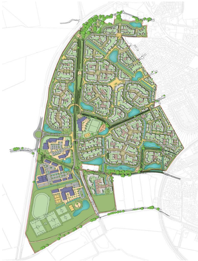
Draft Masterplan for the SUE (larger version at Appendix One)

More specifically, proposals for this area should: