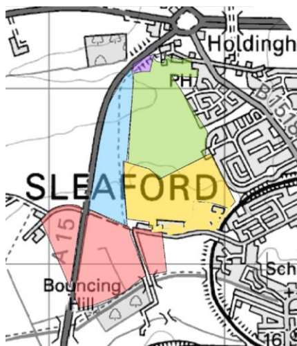
Sleaford West Quadrant Ownership