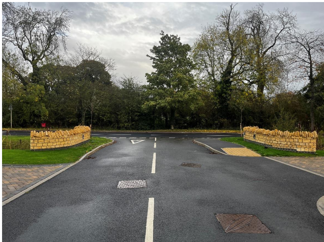
View towards the Manor House from the access roadway leading to the subject site.