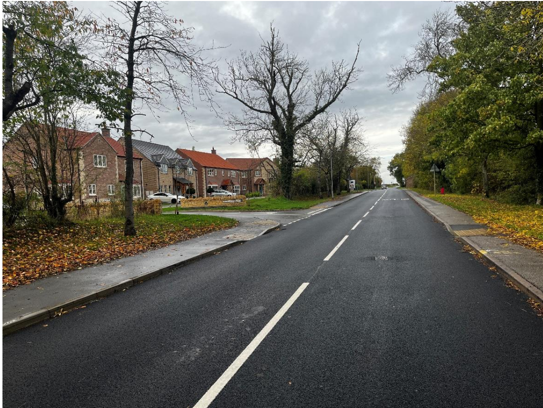
View along main road showing the tree screen to the Manor House along the eastern side of Dunholme Road.