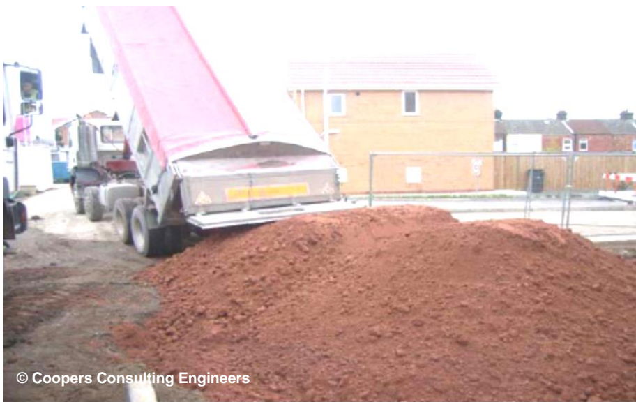
Photographs 9 and 10: Inert crushed sandstone being delivered with remediation break layer visible in Photograph 10. The spatial area of the remediation can be observed from these photographs (old terrace housing in Photograph 9 and traffic lights in photograph 10).