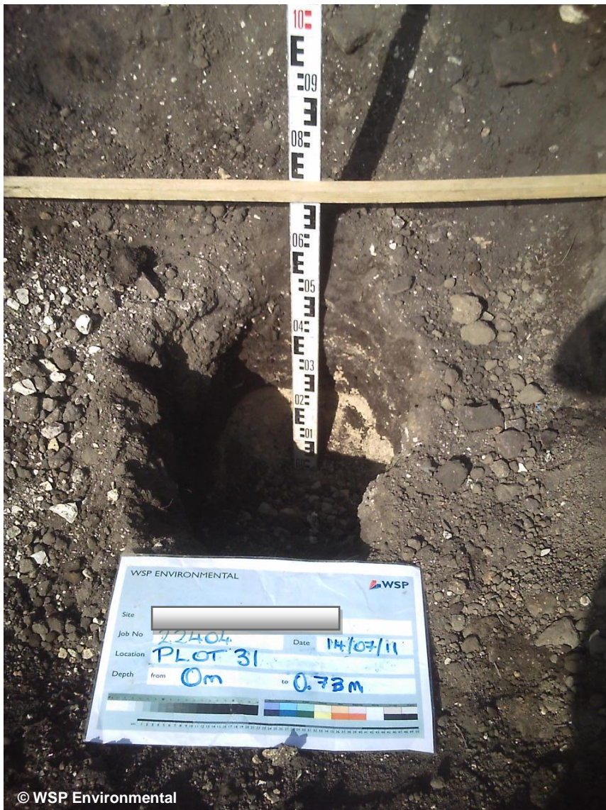
Photograph 2: Depth check of inert cover with Site & Location Information Board.