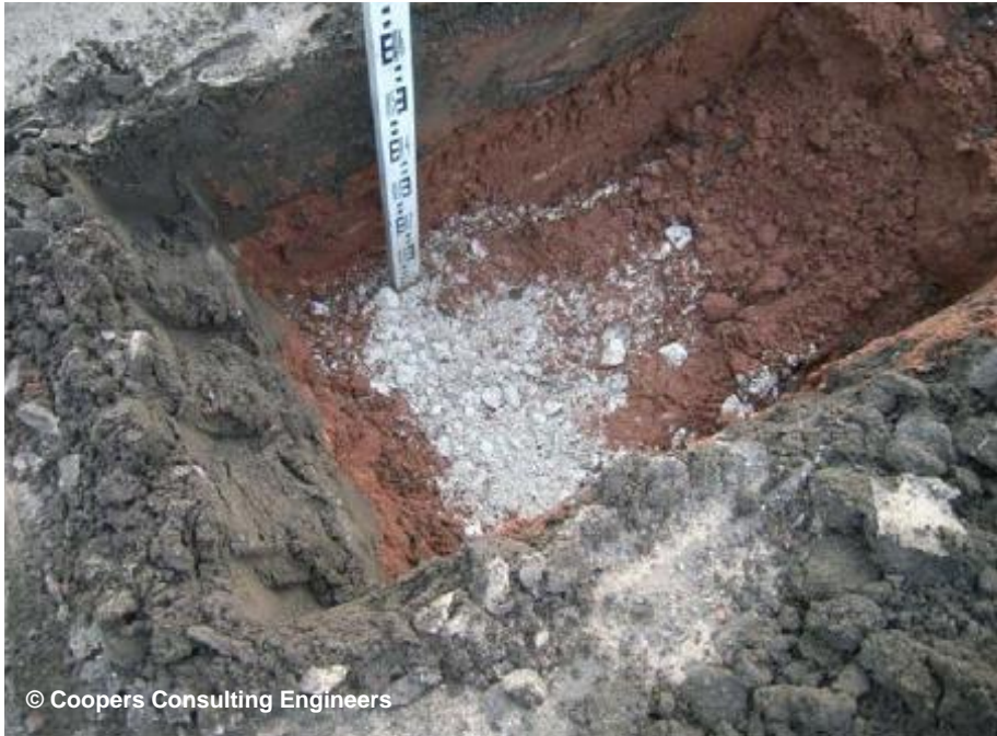
Photograph 8: Excavation within public open space and verification pit showing the presence of a remediation break layer at the base, a crushed sandstone inert fill overlain by topsoil.