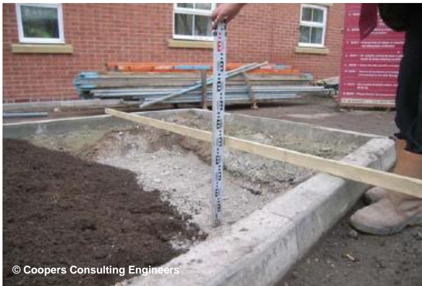
Photograph 1: Depth check of inert cover within area of public open space. Physical break layer and topsoil visible.