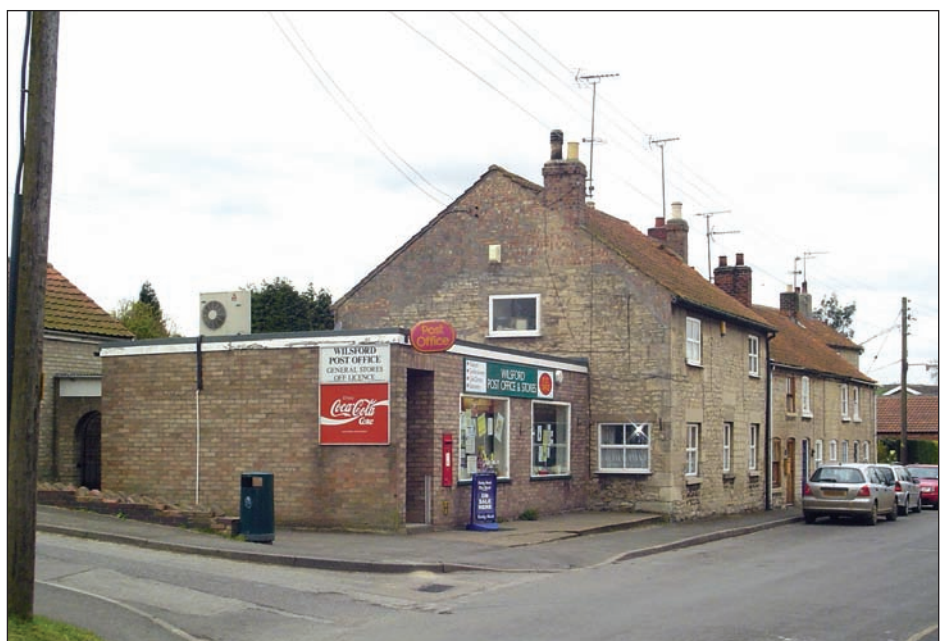
▼ The Post Office, with its flat roof, signage, white painted fascia boarding and air conditioning unit contrasts strongly with the more traditional buildings of the area.