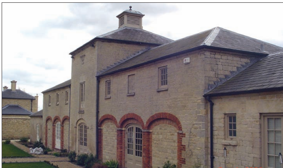
▲ Hall Farm, now converted into a dwelling. This impressive range is a result of it forming part of the setting of the Parish Church and of Wilsford Hall, demolished in 1918.

In the C20 the village site expanded with new housing development taking place to the west of the village on the south side of both Main Street and the A153. The land to the west of School Lane between the village and the former School has also been developed. Within the historic village core some new buildings have been built on the site of former dwellings with additional dwellings being built in former rear gardens and orchards.