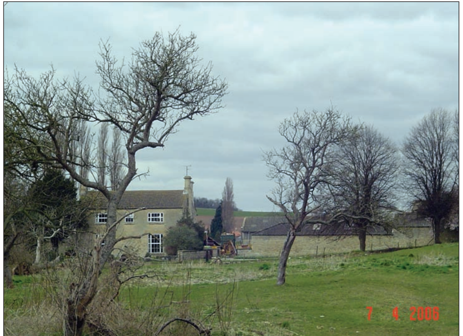
▲ Hanbeck, built in 1847 with its adjacent range of contemporary farm buildings. These are proposed for inclusion within the Conservation Area.