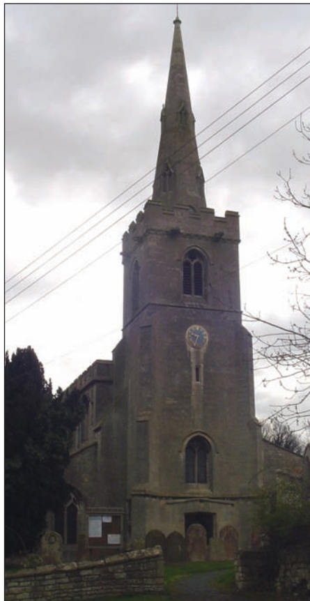
▲ The Parish Church of St Mary is a Grade I listed building. Buildings with this grade are of national importance.

Three buildings are listed as being of architectural or historic interest. These are the Parish Church of St Mary, Home Farm and the former School and School House. The latter is at the south end of the village outside of the Conservation Area. The Parish Church and Home Farm are included in Appendix 1 and shown on Map 3 below.