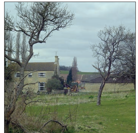
▲ Hanbeck, built in 1847 with its adjacent range of contemporary farm buildings. These are proposed for inclusion within the Conservation Area.

The village lies adjacent to the deserted village of Hanbeck. This lay on the valley side to the north of the Beck. Hanbeck was not recorded in the Domesday Survey and is first mentioned in the Close Rolls of 1242 where it is referred to as Handebek, derived from the Old Norse `Handis Beck`. Aerial photographs and the modern OS maps depict this village as a series of rectangular earthworks either side of a street running east and west half way between the A153 and the Beck, to the west of Hanbeck. The latter is the farmstead which is the only survival of the village site today, together with the line of the A153 which was the Back Lane for the village street and which is still called Back Lane today. The earthworks of the village have largely been ploughed out and little evidence survives on the ground. They are shown on Map 5 attached.