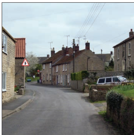
▲ The pinch point in Main Street, the only place where buildings on both sides of the road lie tight up to the back of the footpath.

▼ Buildings on the north side of Main Street line the back of the footpath.