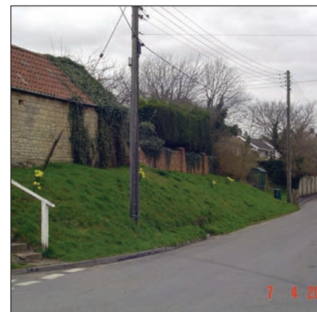
▲ Where the grass banks survive on the south side of Main Street they form a very distinctive feature of the street scene.

On the south side of the eastern half of Main Street the high banks, grassed where there are no gardens running down to the road, define the space. To the west the bank rapidly reduces in size and at the garden of Home Farm it has disappeared. Banks and walls bound the south side of the road with the pavement running only along the north because of its restricted nature.