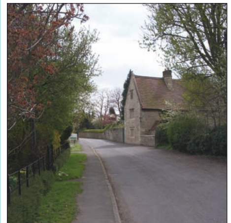
▲ Home Farm is prominent in the street scene at the western end of the Conservation Area. A Grade II listed building, it dates from the early C17 with C19 and C20 alterations.

Home Farm is a farmhouse dating from the C17. Listed Grade II it is of local importance. The former farmbuildings are also considered to be listed by virtue of having been within the curtilage of Home Farm at the time the latter was listed.