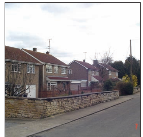
▲ 14 to 20 Main Street were built back from the road edge and the tight enclosure to the street here has been lost. Stone walls, so typical of the street, line the back edge of the footpath.

Another important feature are the number of, predominantly, stone walls to Main Street. They are capped with a mix of concrete, stone, pantile and brick copings. Stone and pantile are the traditional forms of coping for stone walls. These walls serve as boundary garden walls to buildings on the north side of the street and retaining walls to those on the south. As a rule of thumb the walls are constructed of the same material as the buildings with which they are associated. Where stone walls remain, however, efforts should be made to retain and maintain them. Copings are a mix of concrete, stone and pantiles.